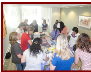
Making H.O.P.E Bags for the O.U.R.M