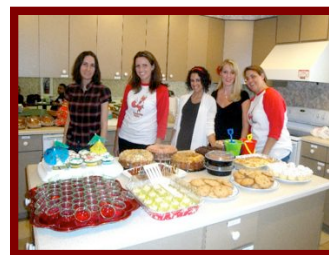
The dessert spread... YUM!

In April, the Vixens were a part of Discovery Church's Holden Heights Revitalization Project . They prepared and served enough food for over 30 workers and homeowners. See what YOU can do, visit www.discoverychurch.org/holdenheights