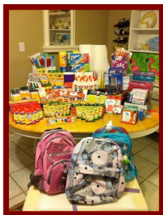
Holy School Supplies!

Another way to give back is to GIVE and The Vixens have been a part of many "drives" where they have collected items to be donated to various businesses and charities, a few being The Orlando Union Rescue Mission, 911 Cell Phone Bank, Casselberry Elementary School, and Florida Blood Centers . It's amazing what The Vixens can accomplish when they all work together!