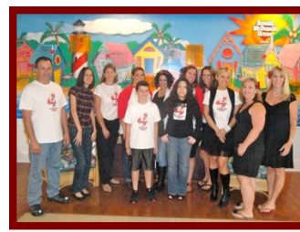
The Vixens...and a couple of our favorite guys!

In June, the Vixens signed up to provide dinner to the residents of The Ronald McDonald House of Central Florida . With a Caribbean theme, it was a HUGE hit with the families and the Vixens had a great time too! Visit http://www.rmhorlando.com/ to see how YOU can help the families!