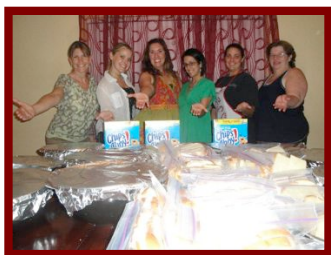
The food prep team!

In April, the Vixens were a part of Discovery Church's Holden Heights Revitalization Project . They prepared and served enough food for over 30 workers and homeowners. See what YOU can do, visit www.discoverychurch.org/holdenheights