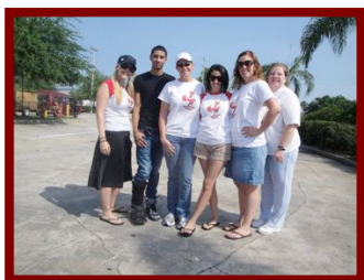
The serving team!

In June, the Vixens signed up to provide dinner to the residents of The Ronald McDonald House of Central Florida . With a Caribbean theme, it was a HUGE hit with the families and the Vixens had a great time too! Visit http://www.rmhorlando.com/ to see how YOU can help the families!